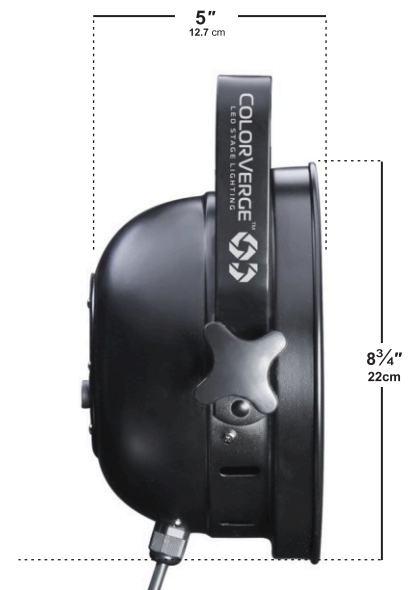
Standard short black housing shown. Optional Chrome available special order.