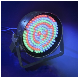
Double-yoke handles act as a floor stand

*Note: When using the Macro Channel 6, channels 1 through 5 become disabled.